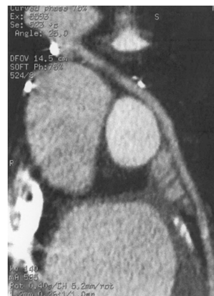
Figure 2. Curved maximum intensity projection (MIP) coronary artery reformat image shows patent venous-LCX graft.